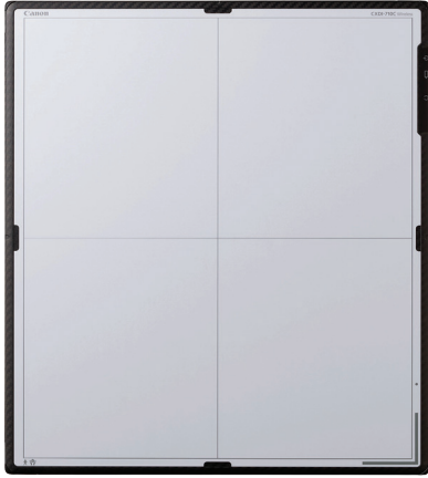
CXDI-710C Wireless Digital Detector