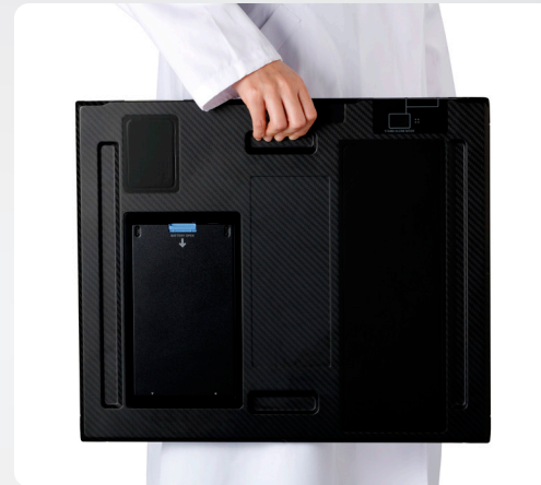
Ergonomically sculpted handgrips