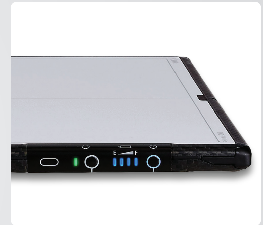
Detector ready function for improved workflow