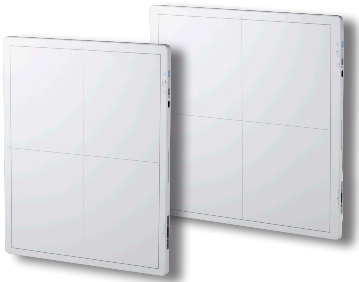
CXDI-702C/402C WIRELESS Digital Radiography Systems