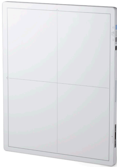
CXDI-702C Wireless Digital Detector