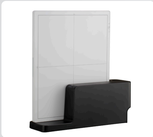
Flexible charging with battery charger or optional CXDI-Docking station