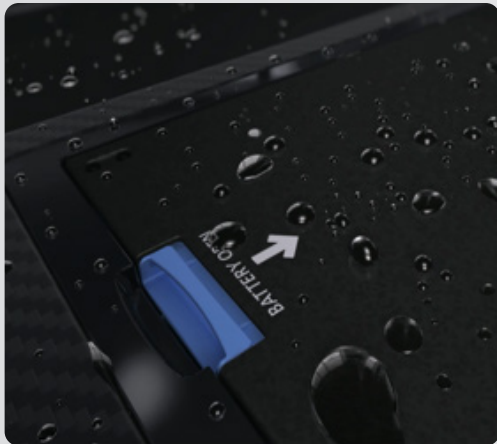
IPX7-rated for liquid intrusion