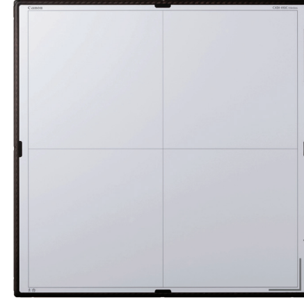
CXDI-410C Wireless Digital Detector