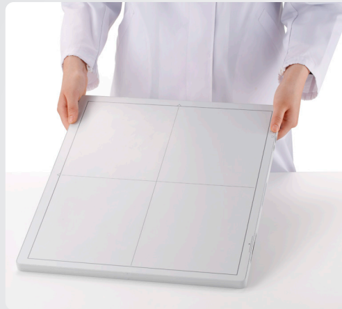
Wireless freedom, flexibility and ease of use