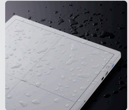
IP55-rated for dust/water resistance