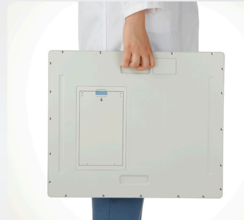
Convenient handgrips on back of detector