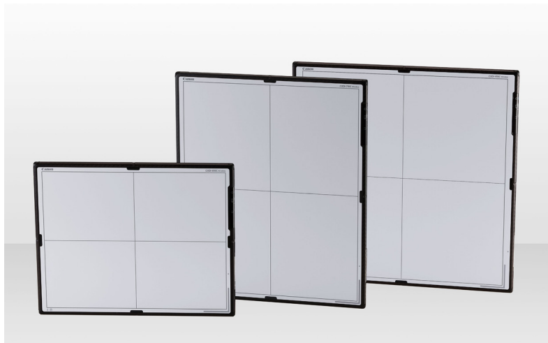
CXDI-710C/810C/410C WIRELESS Digital Radiography Systems