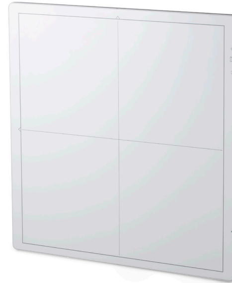
CXDI-402C Wireless Digital Detector