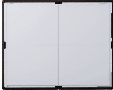
CXDI-810C Wireless Digital Detector